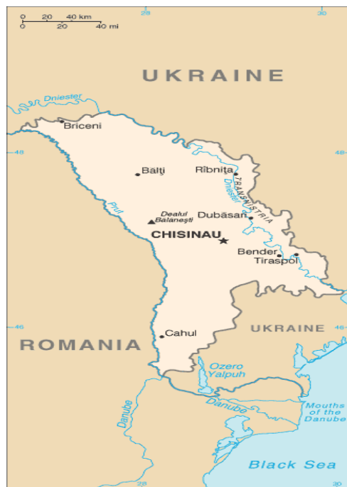
Map of Republic of Moldova